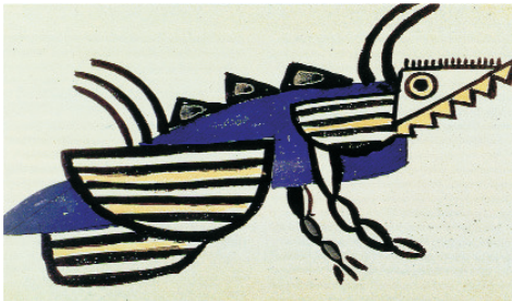
Figure 2. Mikhail Larionov, Le Grillon , sketch of a mechanical costume for Histoires naturelles , 1917–1919. (In: Lesák, Barbara. 1993. Russische Theaterkunst 1910 – 1936. Bühnenbild- und Kostümentwürfe, Bühnenmodelle und Theaterphotographie aus der Sammlung des Österreichischen Theatermuseums . Wien: Böhlau, p. 35.)

Figure 1. Fernand Léger, costume sketch for a beetle in La Création du monde , 1923.